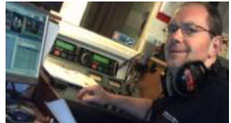
Old ones, new ones, loved ones and neglected ones from our Lismore studio.