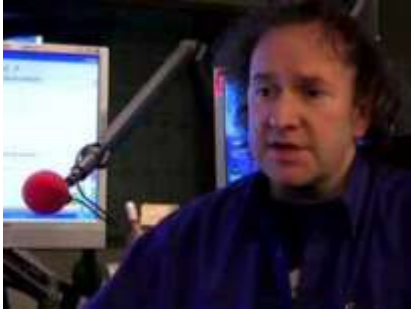
A weekly pot-pourri of music from all eras.