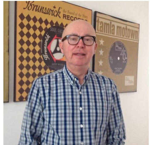
The best soul music on disc from our Glasgow studios.