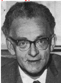
With the final programme to be broadcast by 242 Radio Scotland on 14 th August 1967, and officially relayed by Radio Six on that night. The station's Managing Director recalls the triumphs and sorrows of the station's few years on Scotland's airwaves and bids listeners farewell. The 49 year old boss of the station died a few months later.